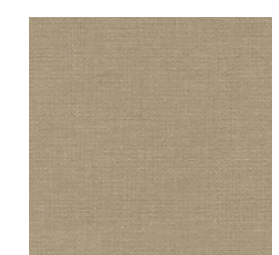
FABRIC: APPOINT/ ARTICHOKE